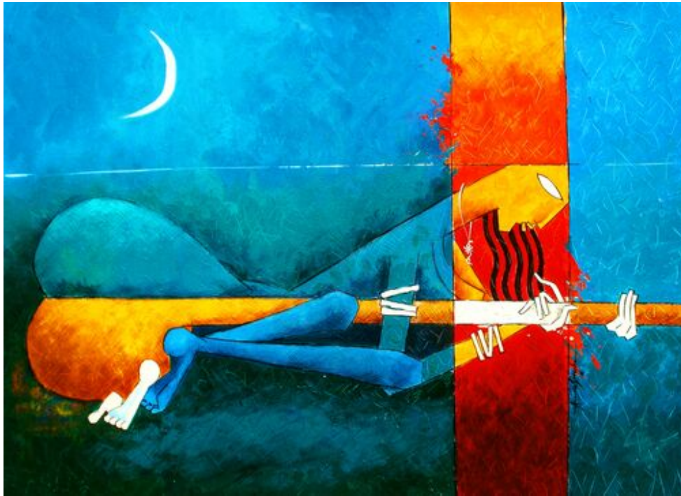
"The Sensation of Music" acrylic on canvas, 33" x 24"

After many years, I emerged, developing a new relationship with the world around me. I learned a lot while on my journey, eventually discovering the reality behind human life. Later on, this new perspective began to be reflected on my canvases. I faced some adversity, but eventually I became a professional artist in 2013. I am inspired by the "melody" or feelings and emotions of human beings—such as blossoming aspirations, torment, exhilaration, anxiety, sorrowfulness, and so on.