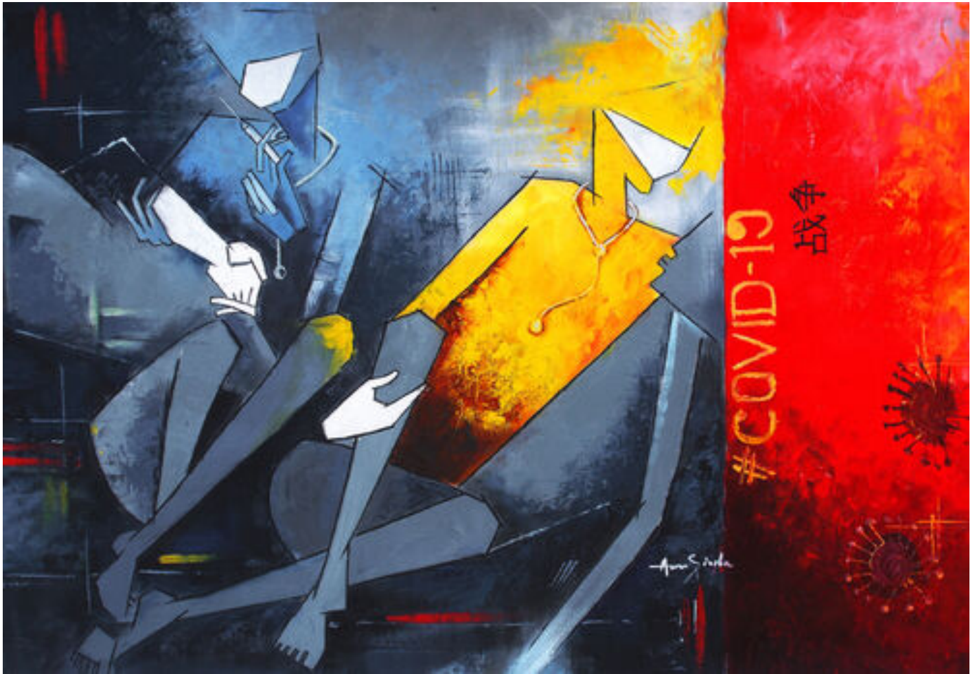
"The Savior" oil on canvas, 27" x 19"

When I approach a canvas, my style is to create a geometric pattern inspired by cubism and imbue it with Indian concepts, ancient Indian grammar and patterns. I bring characteristics of both Indian and western ideas together to help me construct the composition.