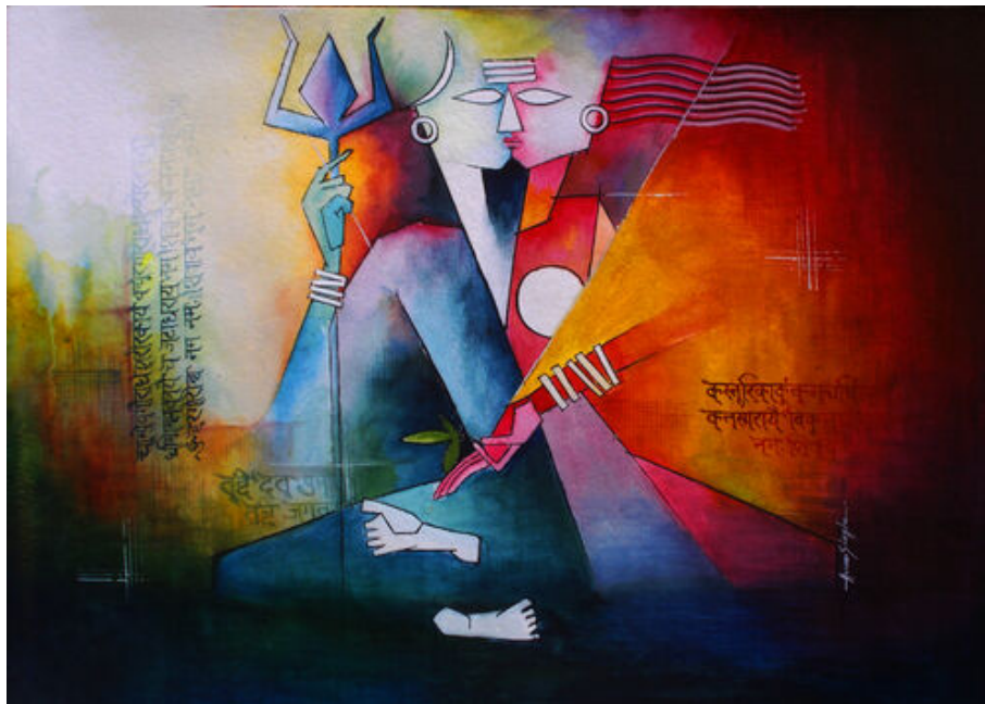
"Ardhanarishvara" watercolor on paper, 30.5" x 22.5"

Nature surrounds me in all its beauty, and whispers to me her stories, which I rephrase with the language of form, color and shape. Based on my emotional approach to my art, I pick up those unimportant things in our daily lives and work to depict them meaningfully on canvas. As a resident of a rural community, I portray the peaceful existence of its inhabitants; they appear on my canvas with a lyrical quality, inspired by the beautiful works of Indian ancestral artists which have always prompted me to keep going.