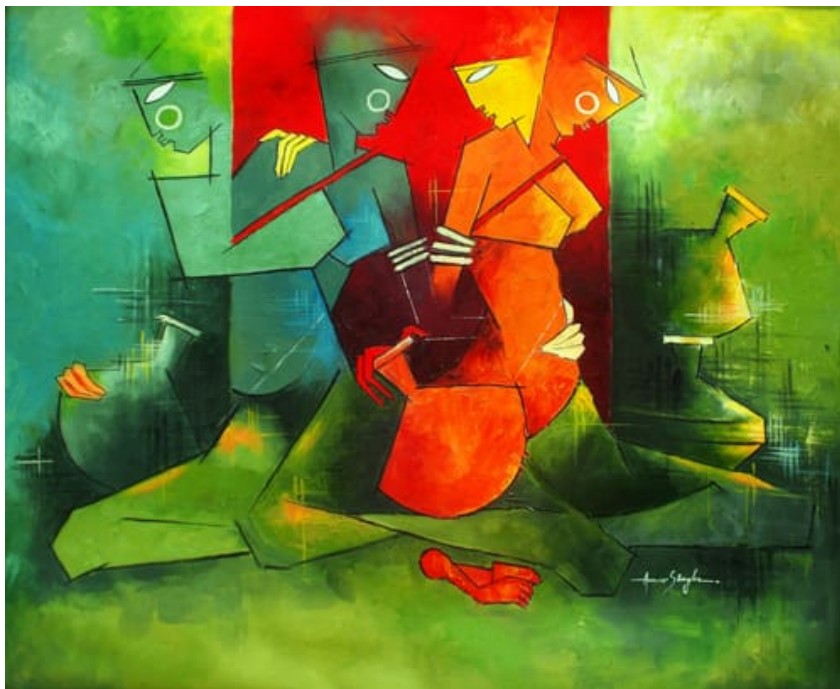
"Gabble" oil on canvas, 30.1" x 25"

I was admitted to an art college in Calcutta. Before I graduated, my father passed away. This threw me into a search deep within myself as to the question of impermanence—life and death. I removed myself from public life to pursue those questions.