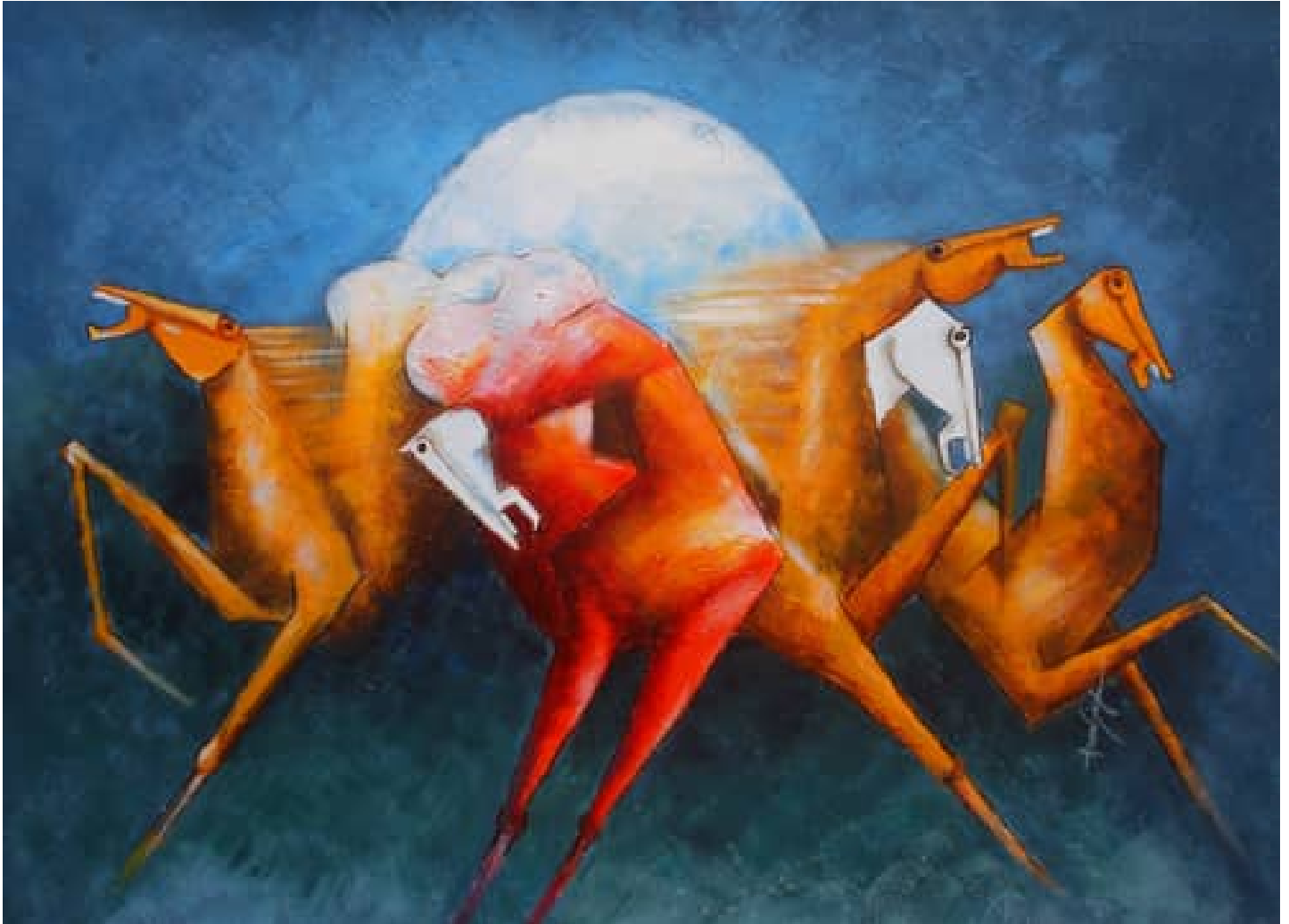
"Exhilaration" acrylic on canvas, 34.5" x 23.5"