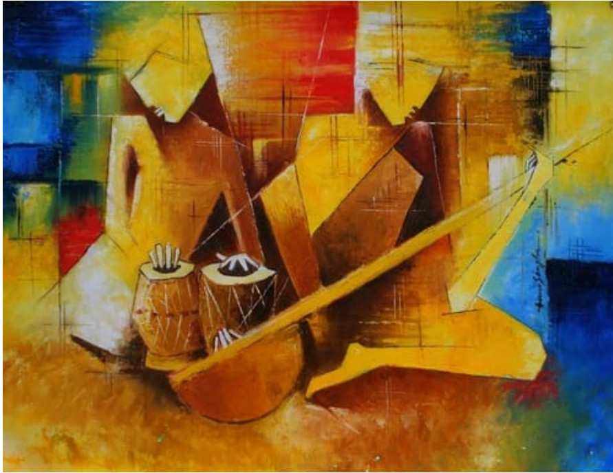
"Concert" oil on canvas, 29" x 22"

Nature surrounds me in all its beauty, and whispers to me her stories, which I rephrase with the language of form, color and shape. Based on my emotional approach to my art, I pick up those unimportant things in our daily lives and work to depict them meaningfully on canvas. As a resident of a rural community, I portray the peaceful existence of its inhabitants; they appear on my canvas with a lyrical quality, inspired by the beautiful works of Indian ancestral artists which have always prompted me to keep going.