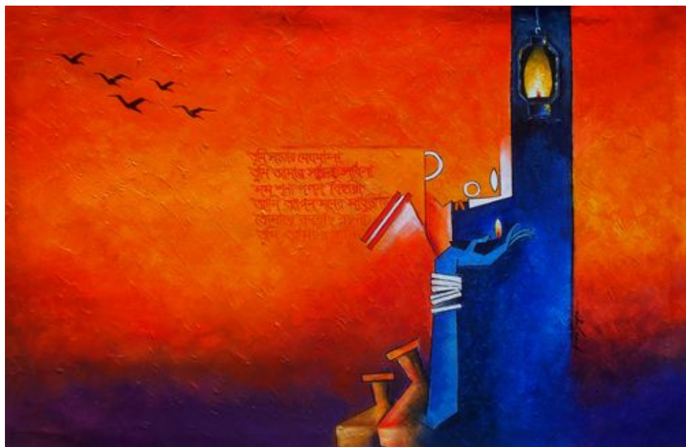
"When Nature Whispers" acrylic on canvas, 34" x 23"

After many years, I emerged, developing a new relationship with the world around me. I learned a lot while on my journey, eventually discovering the reality behind human life. Later on, this new perspective began to be reflected on my canvases. I faced some adversity, but eventually I became a professional artist in 2013. I am inspired by the "melody" or feelings and emotions of human beings—such as blossoming aspirations, torment, exhilaration, anxiety, sorrowfulness, and so on.